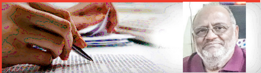
Sirish C. Mohanty

In his address to the nation on April 20, Prime Minister Narendra Modi made exhortations for the youth to form small committees to ensure adherence to COVID-19 restrictions. He has also put the onus on states to decide on lockdowns and other measures. Thus, the central government has adopted more decentralized decision-making as opposed to the modus operandi adopted during the first wave. While only time will tell if this is the right approach, policymakers can learn from success stories of defeating the virus using local mobilization.