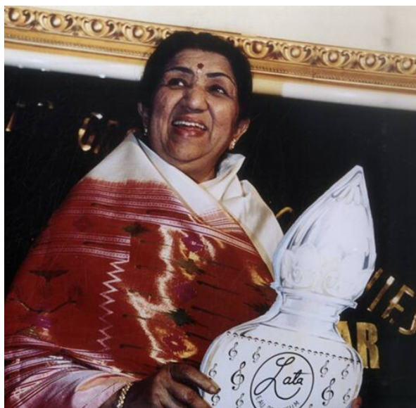
Lata Mangeshkar was 92.

Lata Mangeshkar, one of the country's most towering cultural icons whose singing moved generations since Independence, was so impossibly prolific that she was able to do what artists rarely can.