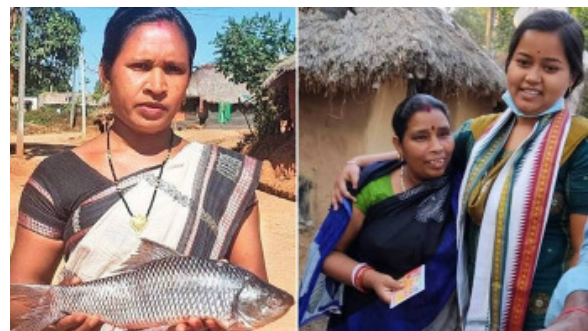
Out of 91,890 wards in the state, 36,523 were won uncontested

The opposition alleged the ruling BJD had threatened candidates from other parties to withdraw their nominations and used foul means to keep them away. "The ruling party's leaders were given charge at the district level to manage the withdrawal of nominations. That such a huge number of seats won uncontested definitely raises questions. We too are in touch with all our party cadres at the district and