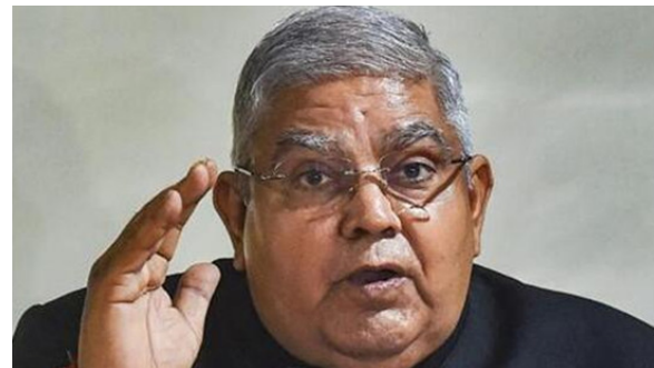
West Bengal Governor Jagdeep Dhankhar

Article 174 of the Indian Constitution says that the Governor shall from time to time summon the house or each house of the legislature of the state to meet at such time and place as he thinks fit, but six months shall not intervene between its last sitting in one session and the date appointed for its first sitting in the next session. Clause 2a of the Article says that the Governor may from time to time prorogue the house or either house or dissolve the (Page-11)