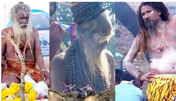
Bhubaneswar's Khandagiri Mela Sees Participation Of Unique Sadhus

Bhubaneswar, Feb 8: Even though the Magha Saptami Mela, also known as Khandagiri mela, is being observed sans devotees due to the present Covid-19 situation, a large number of sadhus have thronged the State capital to participate in the annual festival.