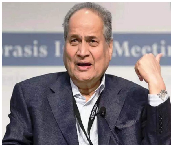
Rahul Bajaj, Chairman emeritus of the Bajaj group