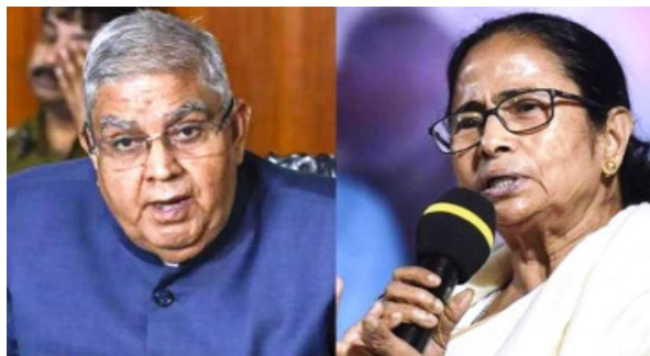
West Bengal Governor Jagdeep Dhankhar with Chief Minister Mamata Banerjee

In recent years, the bitterness between states and Governors have been largely about the selection of the party to form a government, deadline for proving majority, sitting on Bills, and passing negative remarks on the state administration.