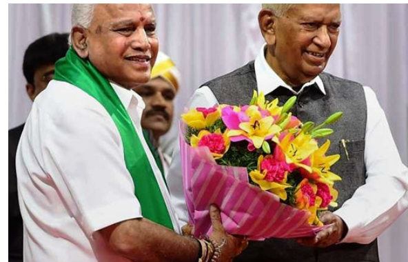
Karnataka Governor Vajubhai Vala and BS Yeddyurappa Constitution."

Constitutional expert Alok Prasanna of Vidhi Centre for Legal Policy said: "The CM is answerable to the people. But the Governor is answerable to no one except the Centre. You can sugar coat it with ideas of constitutional morality and values, but the truth is there is a fundamental defect in the