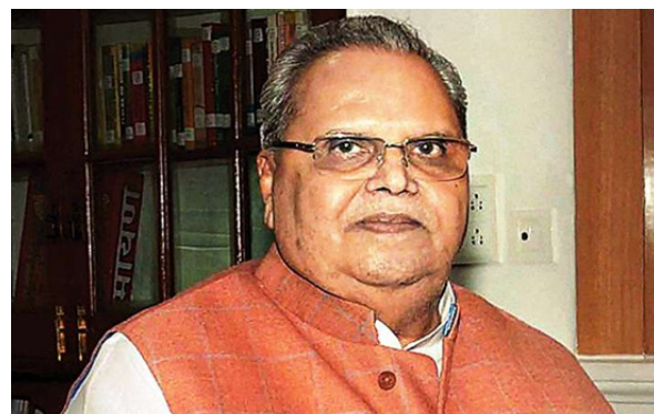
JK Guv Satyapal Malik

Following the Karnataka polls in 2018, Governor Vajubhai Vala invited the BJP to form the government and gave BS Yeddyurappa 15 days to prove the majority. Challenged by Congress and JDS in the Supreme Court, it