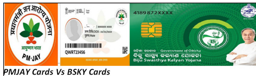
PMJAY Cards Vs BSKY Cards

However, all those low-income households, who don't have any such card, have to acquire an annual income (below Rs 50,000 in rural and Rs 60,000 in urban