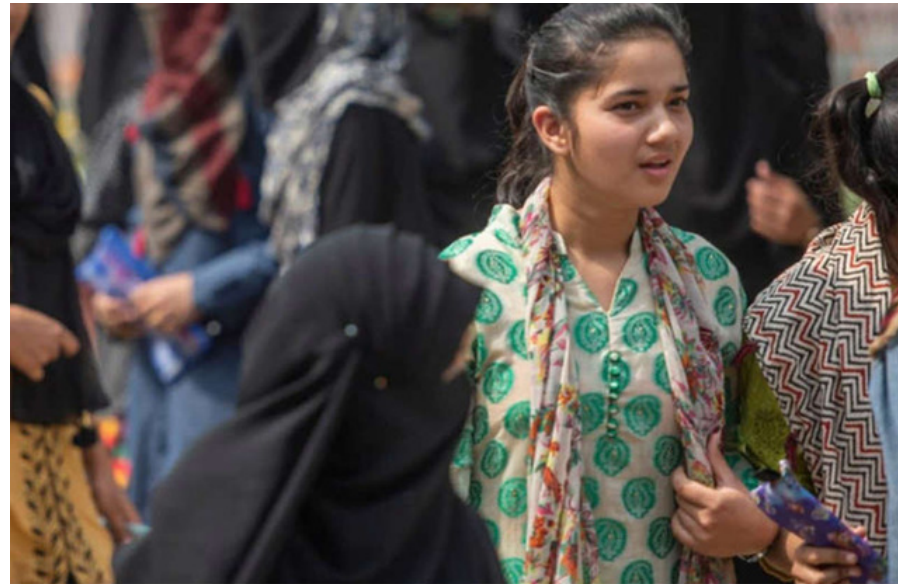
Hijab Row Heats up in Karnataka,