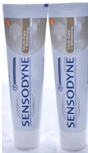
Ordered the discontinuation of advertisements of Sensodyne