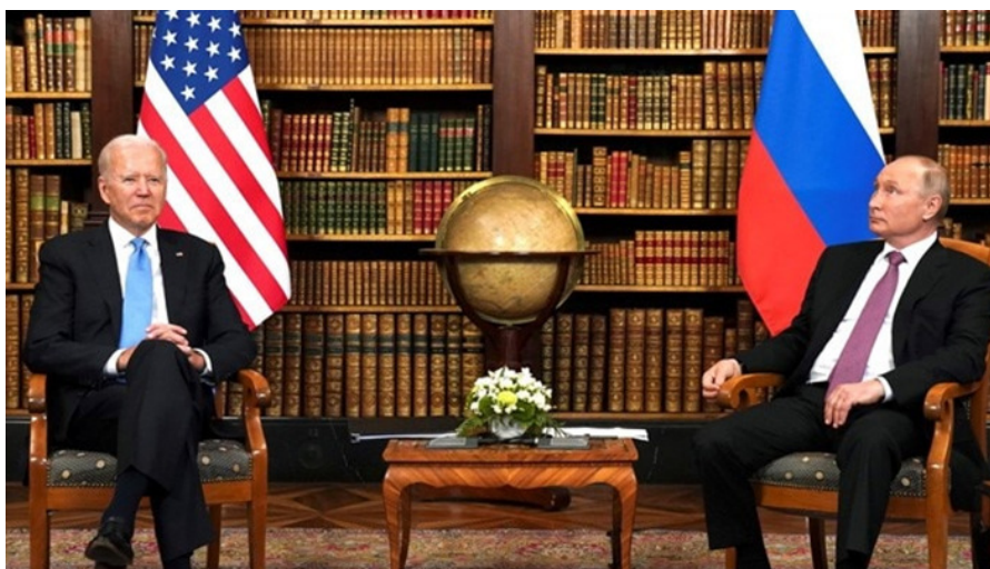
The Biden-Putin talks produced "no fundamental change" in dynamics

Weeks of tensions that have seen Russia nearly