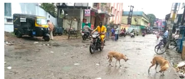
Stray dogs feed on newborn outside government hospital

A pack of stray dogs were reportedly feeding on the body of a newborn outside a government hospital in Odisha's Balasore. A probe has been initiated.