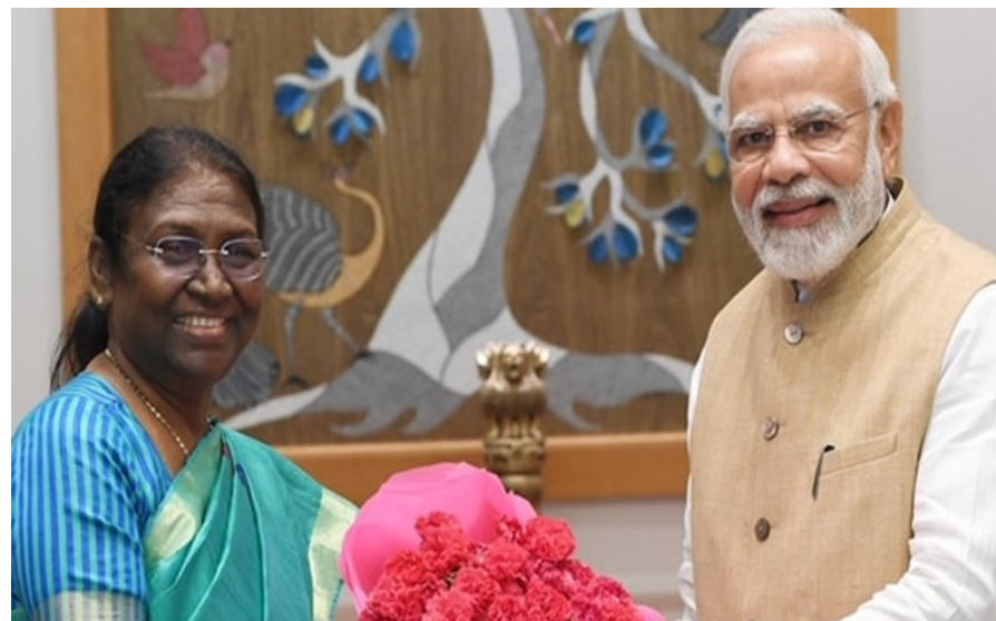
PM Narendra Modi meets NDA's Presidential nominee Droupadi Murmu.

Murmu reached the national capital earlier in the day from Bhubaneswar.