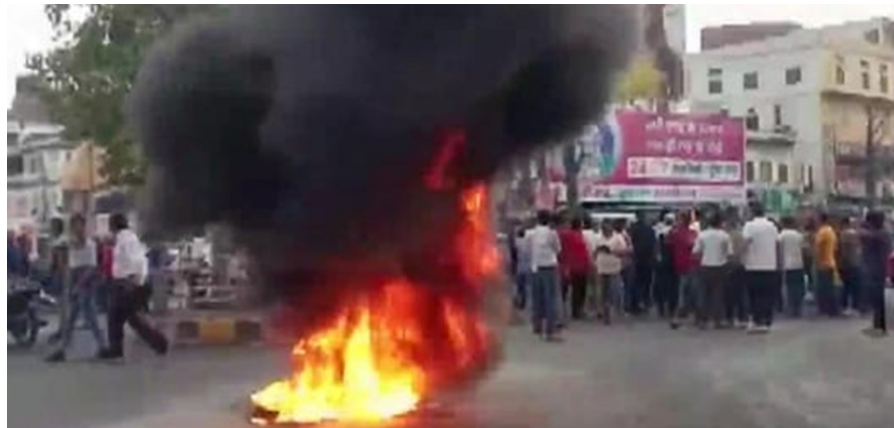
Protest over the murder

Udaipur, June 28: A youth was beheaded by two men in the Maldas street area of Udaipur, Rajasthan, on Tuesday. The deceased had reportedly shared a social media post in support of suspended BJP leader Nupur Sharma, a few days ago. Chief Minister Ashok Gehlot said both the accused youth were arrested from Rajsamand, adding investigation in the case will be done under the Case Officer Scheme to ensure speedy trial.