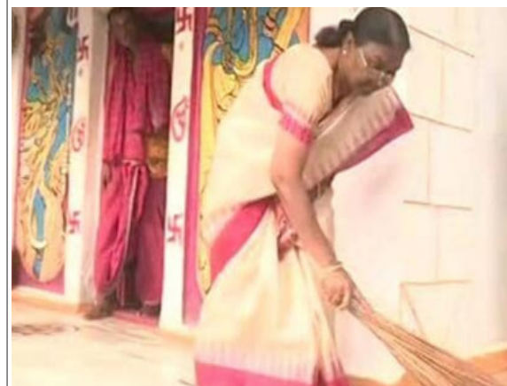
NDA's President-nominee Droupadi Murmu sweeps temple floor

Her neighbours in Rairangpur said they have been feeling too euphoric after the announcement last night. "We are still unable to come to terms