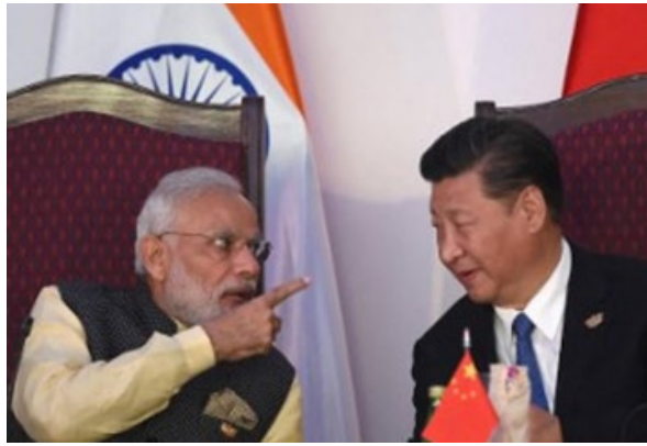
China Offers An Olive Branch To India; Blocks Pakistan

not a frontrunner to become a member of the organization.