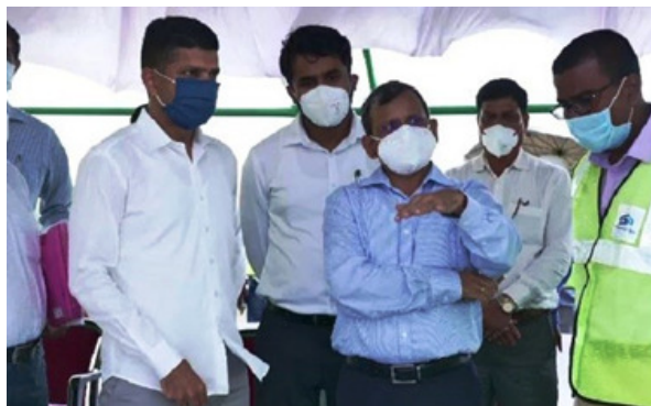
5T secretaries in action

While Government in a parliamentary democracy implements policies of the party in power, Bureaucracy cannot coalesce with the party. It must retain its political neutrality. It would witness the win or defeat of the party in power with the same sense of detachment. It would neither rejoice nor