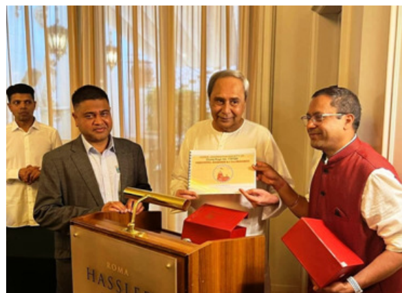
Naveen meets Odia diaspora in Rome