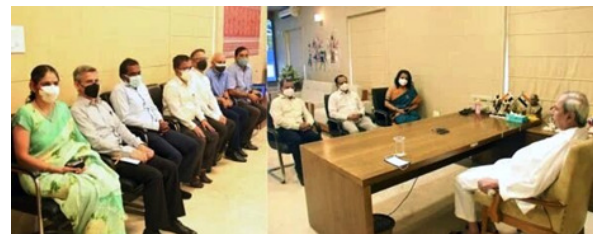
Senior Babus greet Naveen on electoral victory

senior IAS and IPS officers including the Chief Secretary, Development Commissioner, DG Police, ADGs, Police Commissioner and Service