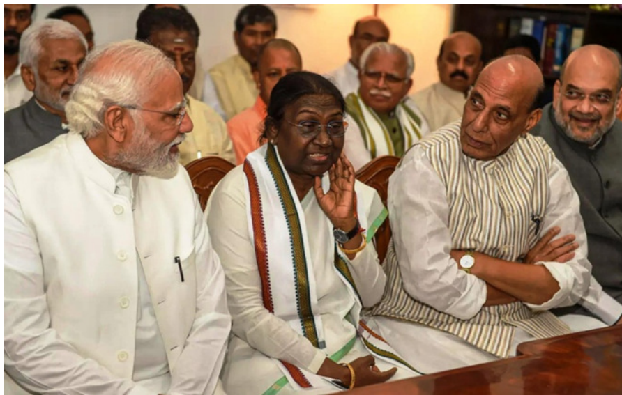
PM Modi with NDA Presidential candidate Droupadi Murmu in New Delhi.