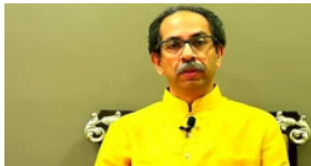
Uddhav Thackeray addresses the state on Wednesday.

Uddhav Thackeray thanked Congress leader Sonia Gandhi and Nationalist Congress Party (NCP) supreme Sharad Pawar for supporting the Shiv Sena.